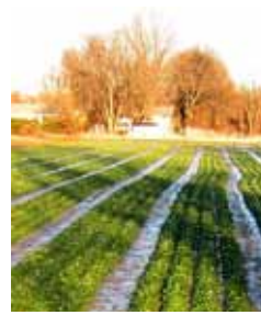
Anderson Farms. Spinach: planted in October, ready to eat in May. Spring plowing. Sweet corn tassels spreading pollen on the wind.