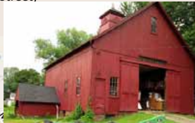
Anderson Farms on Broad Street Green