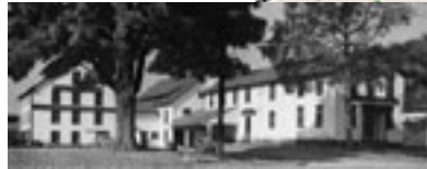
Comstock Ferre, & Co.