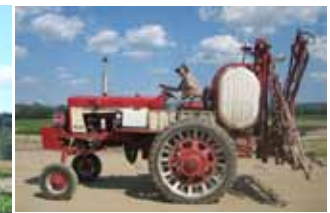
FWA grows, harvests, and processes wholesale green beans in huge quantities, while diversifying into grain corn and a plethora of vegetables for their farm stand and CSA customers.